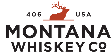
B. WITH ELK - STACKED