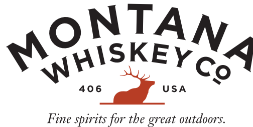
C. WITH ELK - ARCH + TAGLINE