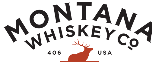
Primary Logo A. WITH ELK - ARCH